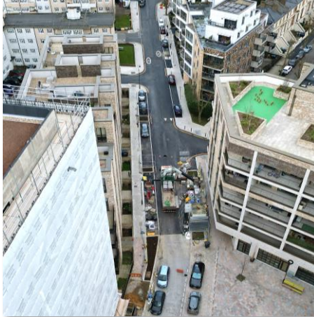
Canterbury Road - east

The upgrade works to Canterbury Road have reached practical completion. The eastern end has been rebuilt including new footways and parking bays, and resurfacing took place during February half term. The brand new western section of the road has also opened, running through the top of Peel Plaza and running west to Rupert Road. As well as improving connectivity, these works have provided new on street parking. The works have been generously supported by the GLA.