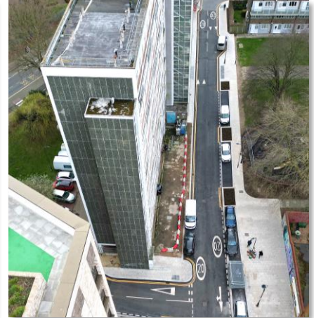
Canterbury Road - west