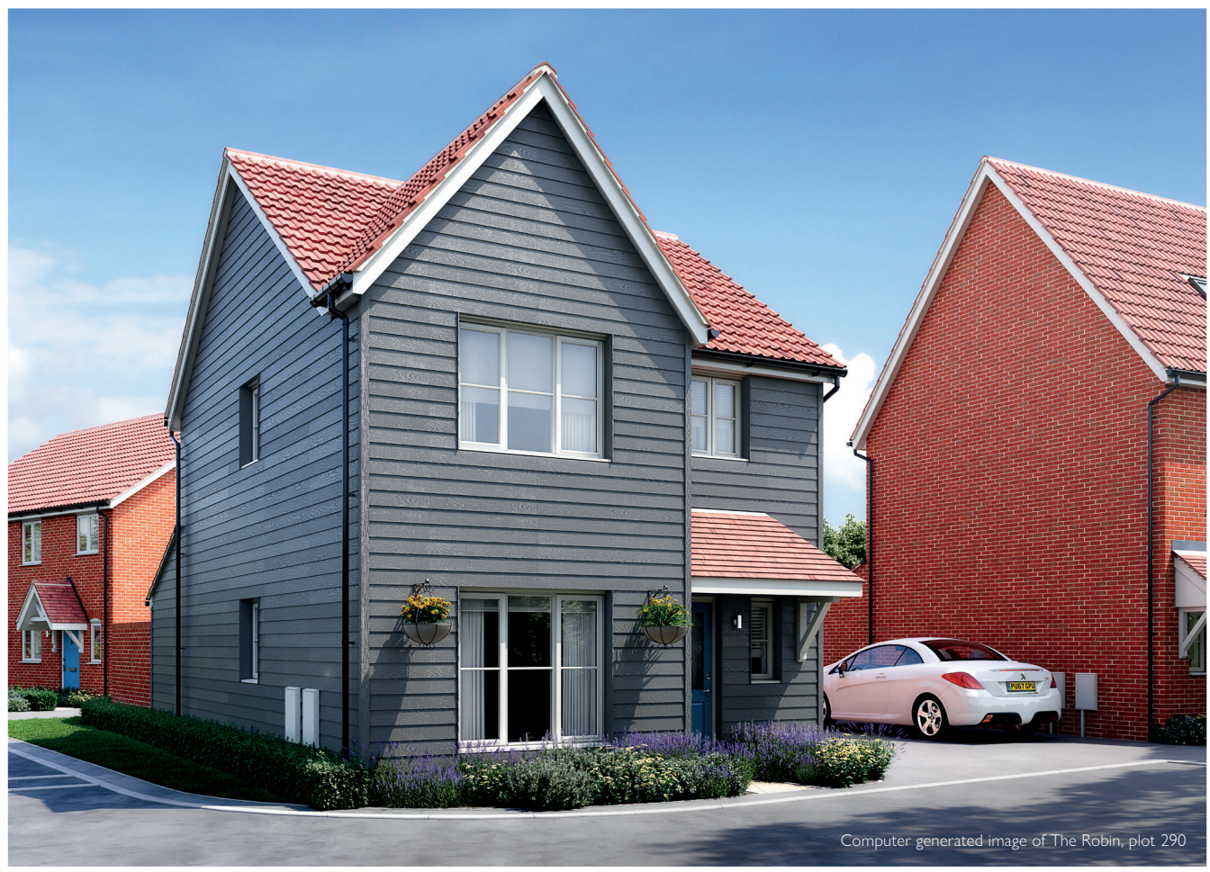
Computer generated image of The Robin, plot 290