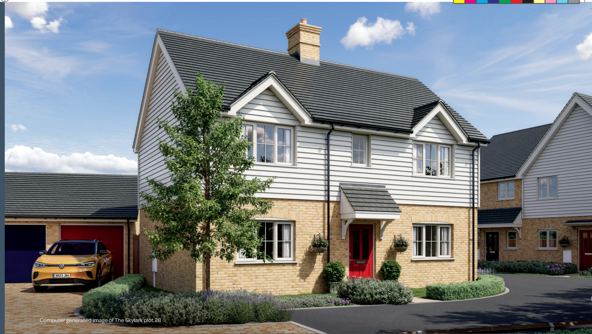
Computer generated image of The Skylark plot 28