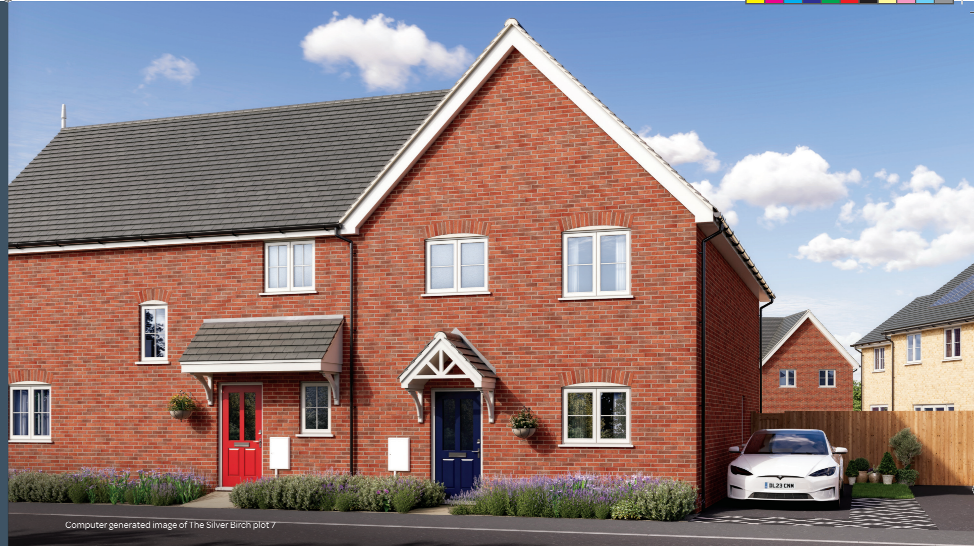
Computer generated image of The Silver Birch plot 7