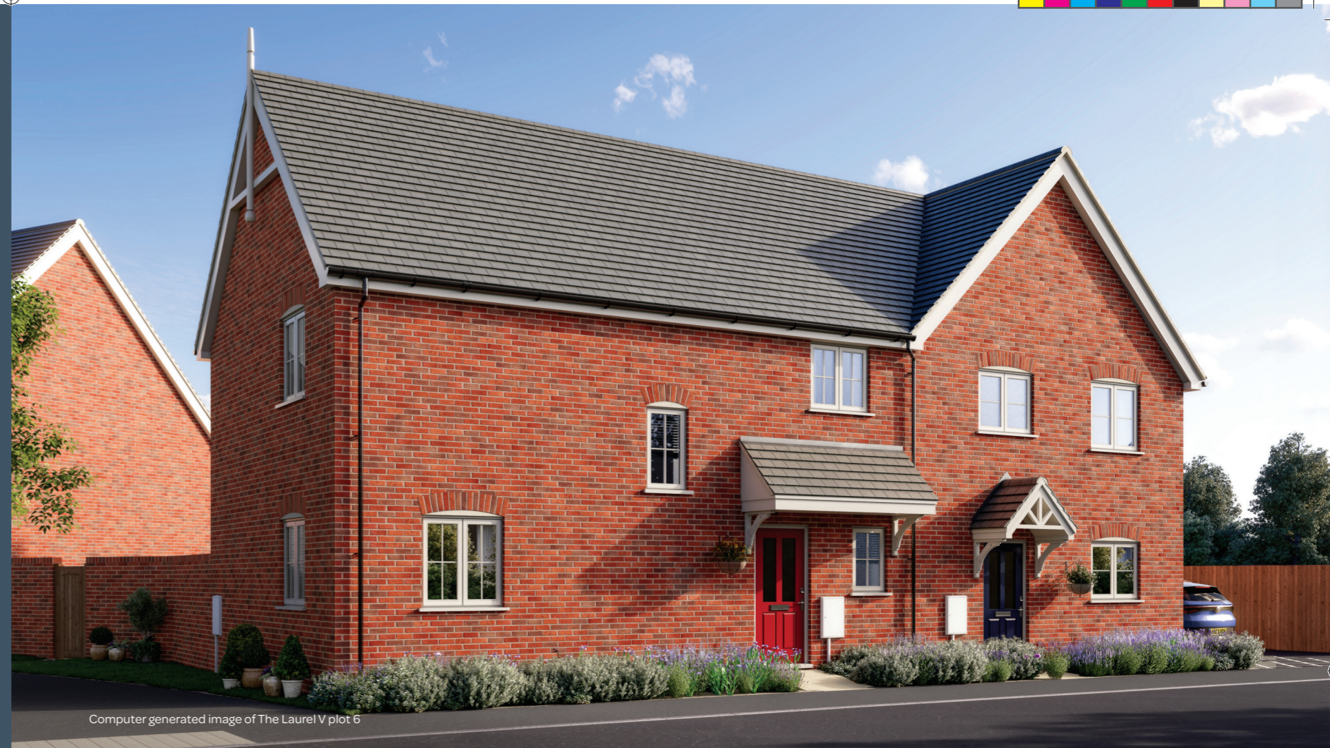
Computer generated image of The Laurel V plot 6