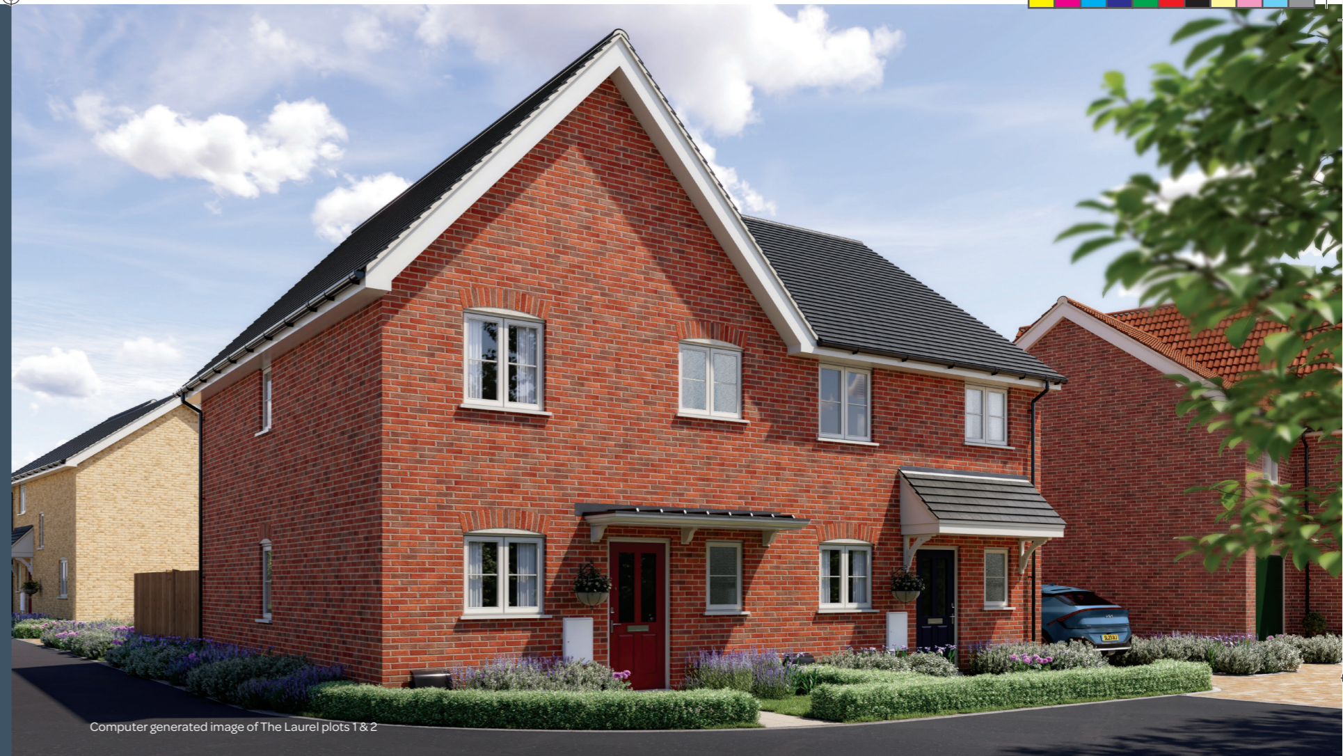
Computer generated image of The Laurel plots 1 & 2